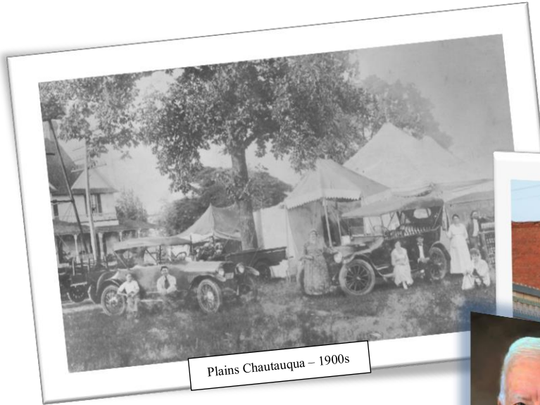
Plains Chautauqua – 1900s