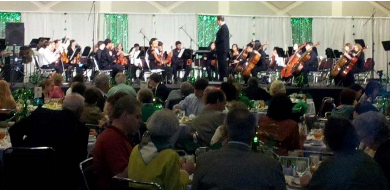
Youth Orchestra of Greater Columbus “Luck of the Irish” Pops Concert and Luncheon March 2013