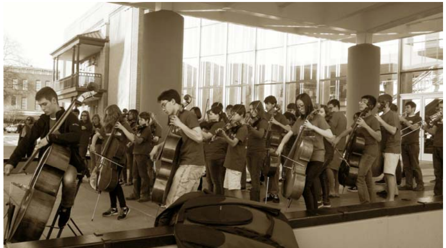
Youth Orchestra of Greater Columbus musicians perform a flash mob in front of RiverCenter during Artbeat 2013.